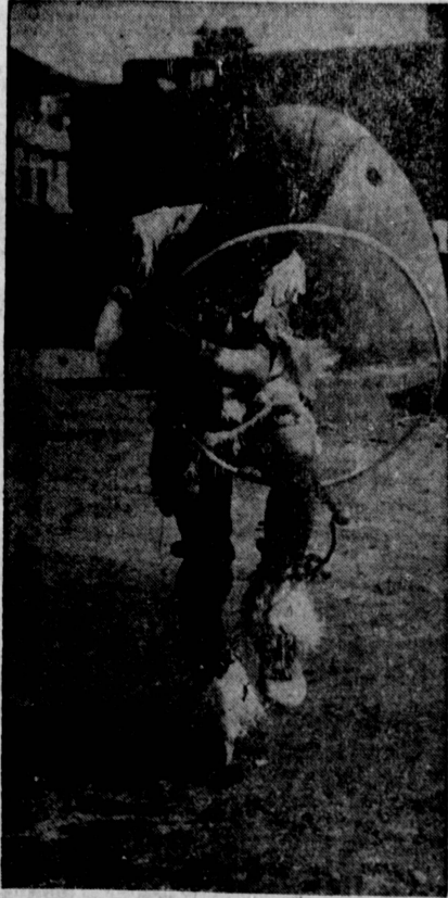
ON WAR PATH... Authentic Indian dancers in full costume will perform tribal dances and sing during Leonard's gigantic "Price War Path" celebration Saturday from 2 to 2:30 p.m. in the parking lot at 25405 Crenshaw Blvd. Indian dancer does the Hoop Dance above at left. At top right, Indian child demonstrates Eagle Dance; in the center a dancer does the Horse Tail Dance; and at lower right, an Indian performs the Shield Dance.