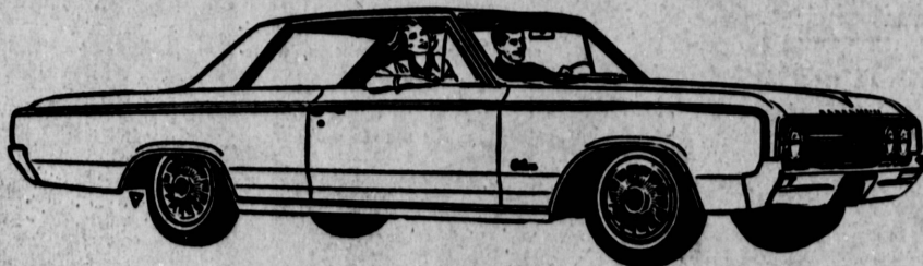
CUTLASS HOLIDAY COUPE

F-85 Stepped up in size... Stepped up in performance!