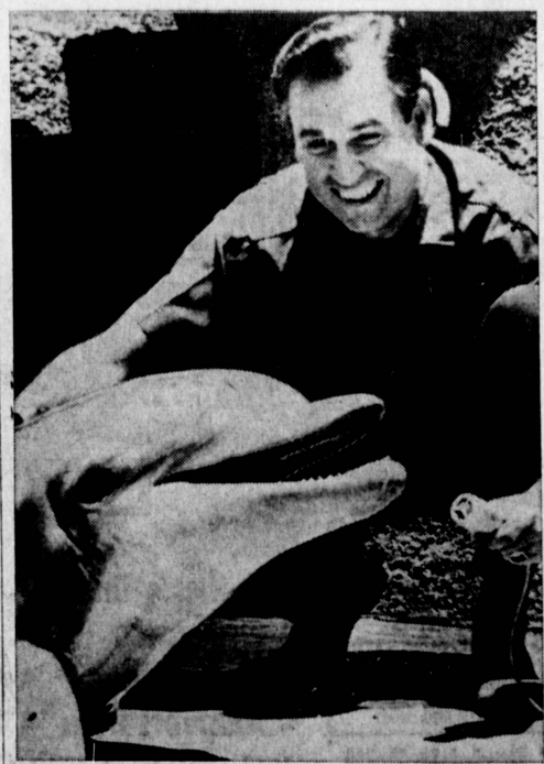
SPEAK UP... Bob Barker, emcee of NBC's "Truth or Consequences" show, interviews Flipper the bottlenose dolphin at Marineland of the Pacific. The television program will tape two shows at the oceanarium Wednesday with the Marineland audience participating in the shows.