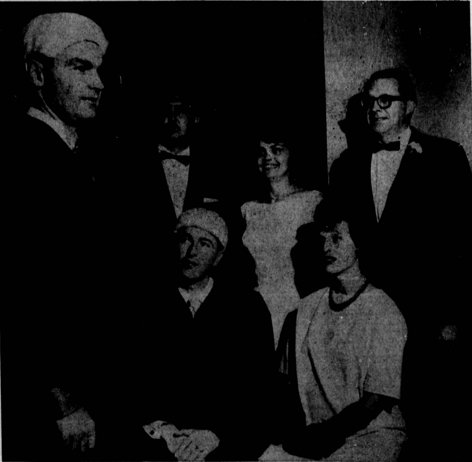
CONTINENTAL JURISPRUDENCE . . . When South Bay barristers, their wives and guests arrive at the Palos Verdes Country Club Saturday evening for the annual "Counselors' Cotillion," they will be greeted by lawyers wearing their robes and wigs, carrying out a "continental" party theme. In a preview for this brilliant social