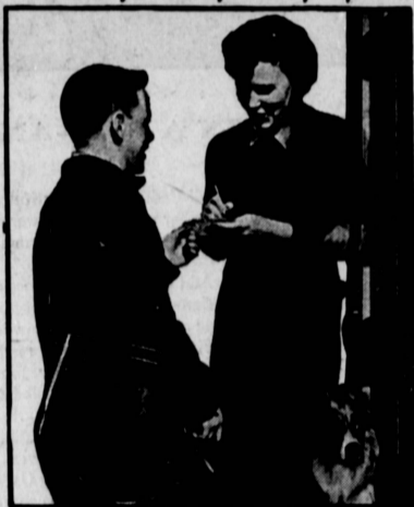
Busy Boys Are Better Boys

Not learning how to sell and how to get along with people