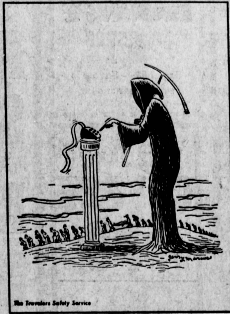
The Travelers Safety Service