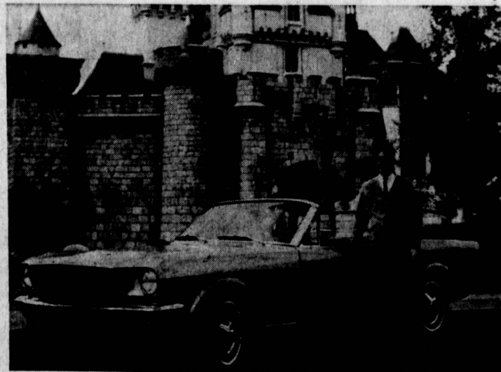
FOR LUCKY GRAD . . . Raul Matute, senior class president at South High, gives a new Ford Mustang the once-over at Disneyland. The car will be given to some lucky graduate during an all-night party at Disneyland June 11. About 30 schools, including South and West High, will send their grads to the storybook land for the all-night party June 11. Odds for any one grad on the car are probably 2,500 to 1.