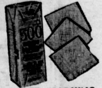
PAPER NAPKINS 66¢

Super-strong, white, extra deep. 100 banquet 9" plates or 100 fluted 6" plates.