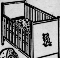
DROP SIDE CRIB

Big, white drinks. 80 cups or 50 cups. Reg.