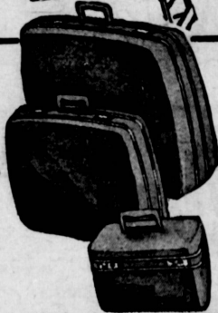
3-PIECE LUGGAGE SET

Contoured long bound cases. Set includes 14" cosmetic case, 21" weekend case and 26" Pullman. Vinyl plastic, boucle pattern. Triple stitched with heat sealed bindings. Rayon tafeta linings with 4 puffed pockets. Colors: red, white, blue, green, mocha. Plus Fed. Tax.