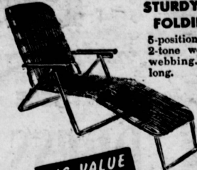
STURDY ALUMINUM FOLDING CHAISE

6-position adjustable back. 2-tone weather-wise poly webbing. Folds flat. 74" long.