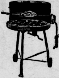
24" MOTORIZED B.B.Q. BRAZIER

It's time to move outside for delightful eating. This brazier has a heavy duty firebowl and sets sturdily on tubular steel legs. U.L. approved "swing-out" motor is guaranteed for one full year.