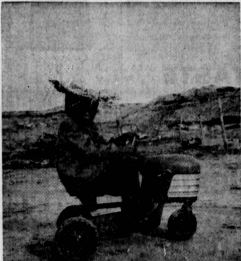
GIFT FROM TORRANCE . . . One of the major projects of the Torrance Family YMCA is helping others. Torrance youngsters collect clothes and toys for Navajo Indians in Arizona. Here, a Navajo youngster rides one of the gifts that was sent from Torrance.

25 camps sponsored locally. Here, a group of local youngsters is seen leaving the old YMCA for a trek to faraway, less crowded places.