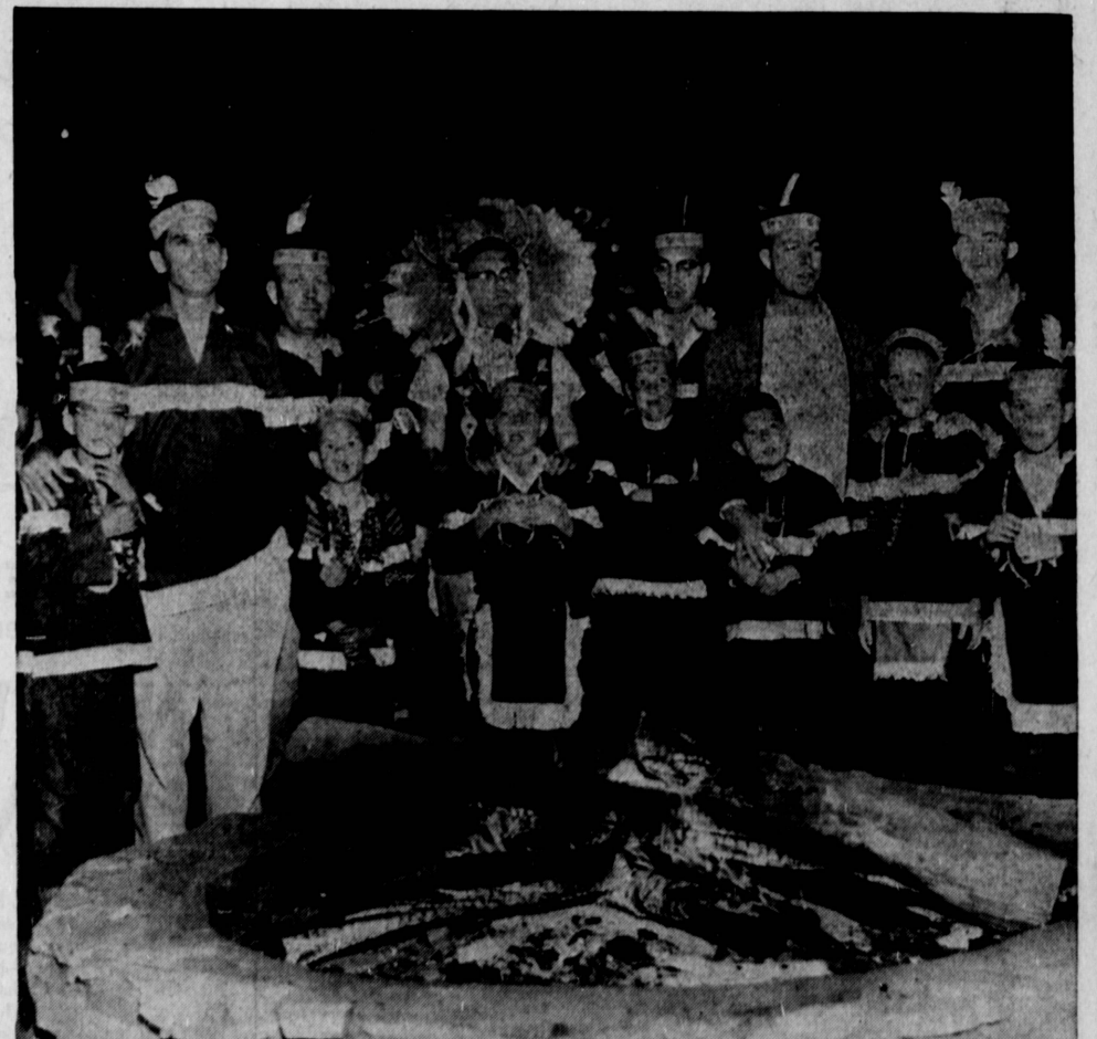
CAMPFIRE CIRCLE . . . One of the features of the new YMCA for which funds now are being sought will be a campfire circle which will accommodate up to 1000 people

for large "woosy" type meetings. The type of scene represented in this picture will be recaptured many times at group meetings in the new "Y".