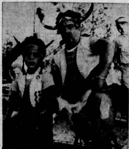
HEAP BIG CHIEF . . . One of the biggest programs in the Torrance Family YMCA's program is the Y-Indian Guide program. Eighty-six Guide tribes currently are active in the local program. A major reason for a new building would be to obtain more meeting space.