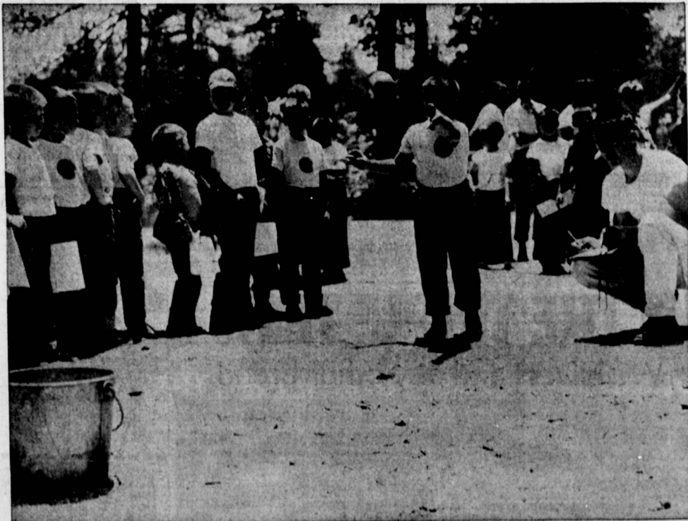
TOMORROW'S CITIZENS . . . Providing good, constructive activities for local youngsters is one of the purposes of

than 600 workers. The new facility will contain many meeting spaces for the 174 clubs involved in "Y" activities and serve as a center to replace present inadequate facilities. A second unit will include a gym and swimming pool.