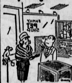
"Well, I haven't found any that like me."