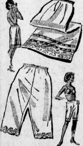
Lovely Lingerie Fashion Duette