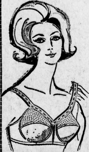
Have You Heard About the New