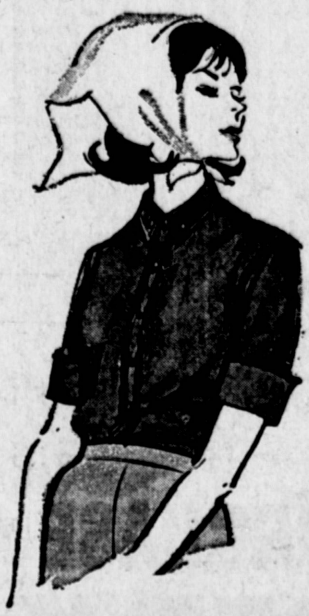
Color Fantasia of "Spring-Fresh"