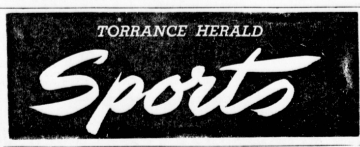
JANUARY 23, 1964

IN THE third period, Tor-rance hit its coldest streak, go-ing almost four minutes with-out scoring.