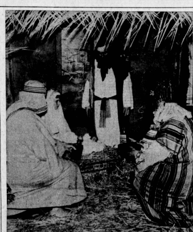
NATIVITY SCENE . . . Members of the South Bay Church of God, 17661 Yukon Ave., will present a pageant of the nativity scene at the church each night until Dec. 23. The presentation, to be narated by the pastor of the church, will be accompanied by music from the church choir. The annual presentation is open to the public. Presentations will be made each night at 7 p.m., and again at 8 p.m. (Story on Page 3)