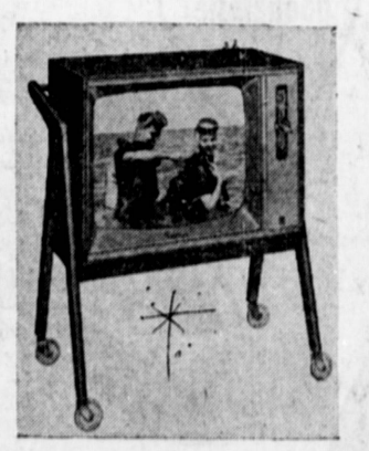
"GREENBRIER 23" VIDEO-MATIC TV