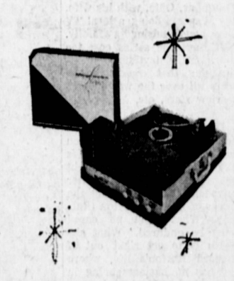
STEREO -HI-FII PORTABLE