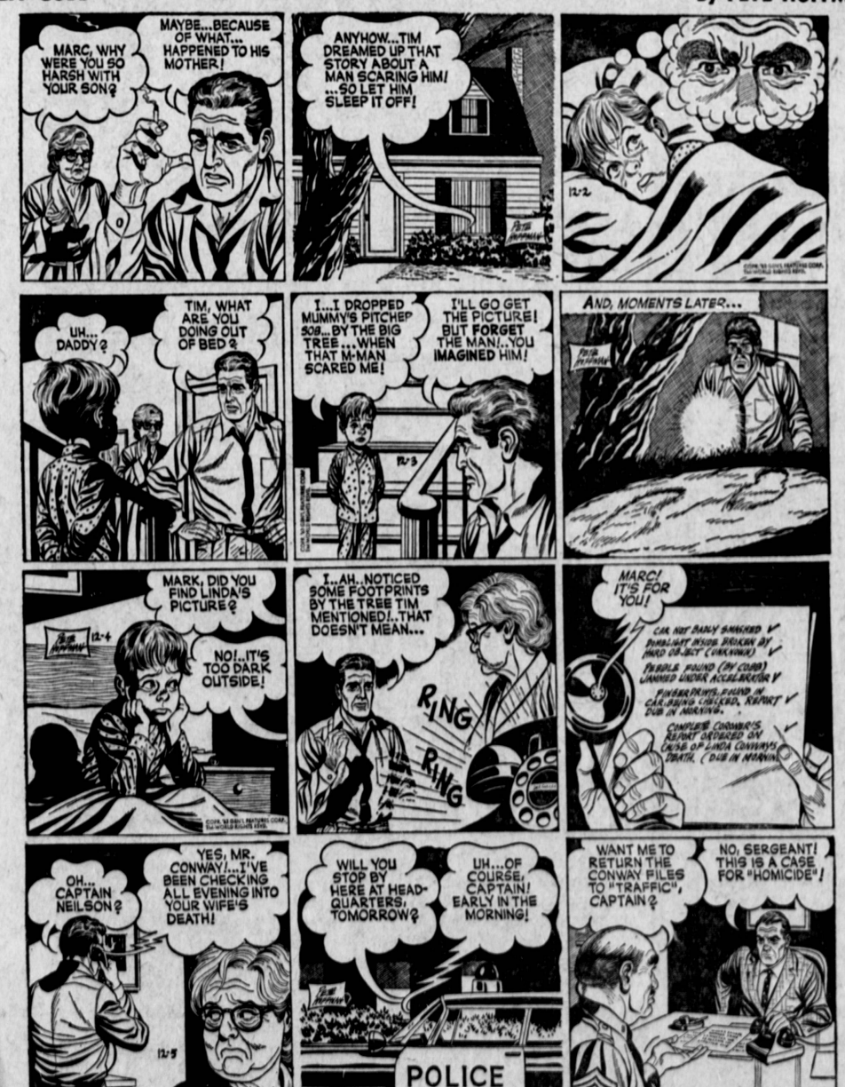
Follow Sunday's Herald Comics for Full Pleasure