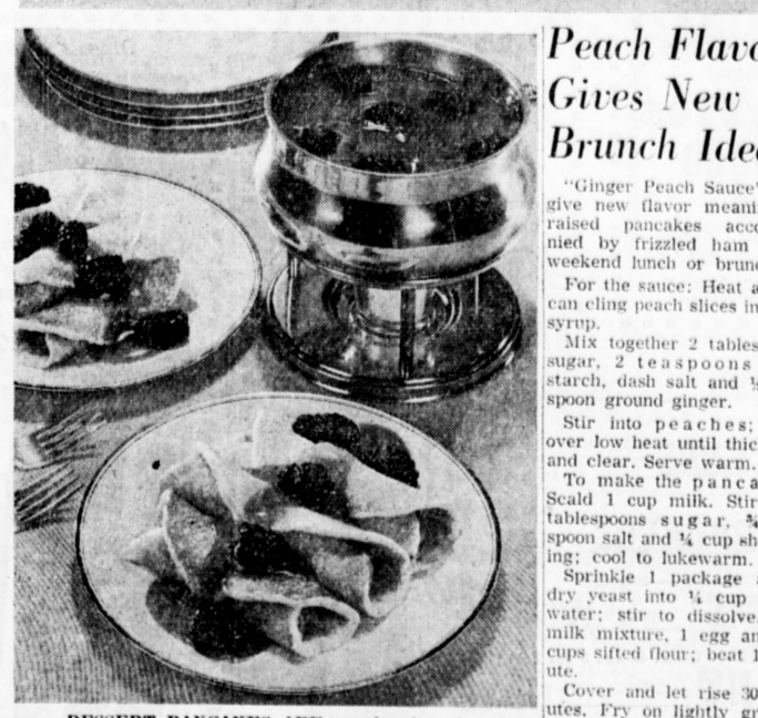
DESSERT PANCAKES ARE popular fare for com-pany menus. Sauces a-flame make them elegant. This sauce is made with boysenberry syrup, highlighted by whole berries which come to you in frozen form.

tions." A corresponding p a s s a g e from the Christian Science textbook reads: "When man is governed by God, the ever-present Mind who understands all things, man knows that with God all things are possible."