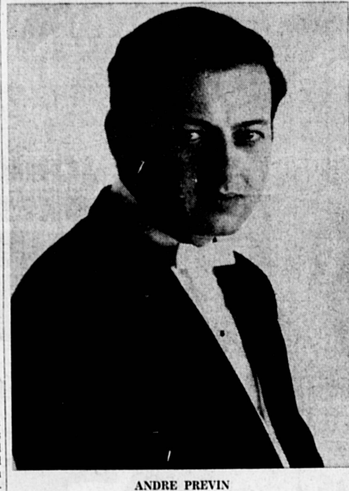
Appears at Marineland

One month from photo day, a contest, composed of pictures taken on Sunday, will be held. Offered as prizes to photogs will be a studio light meter and