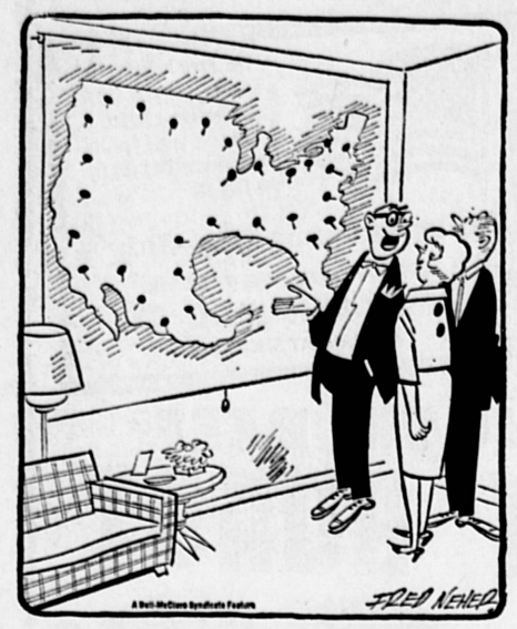
"They're not salesmen . . . We're planning a vacation trip and they're relatives."