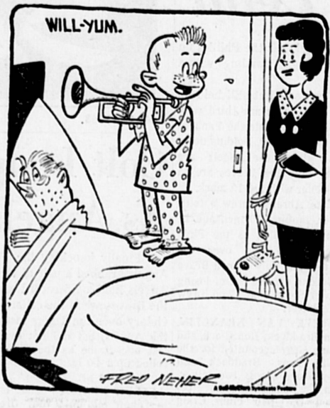
"What do you mean it didn't sound like 'revielle' ... It got Pop up, didn't it?"