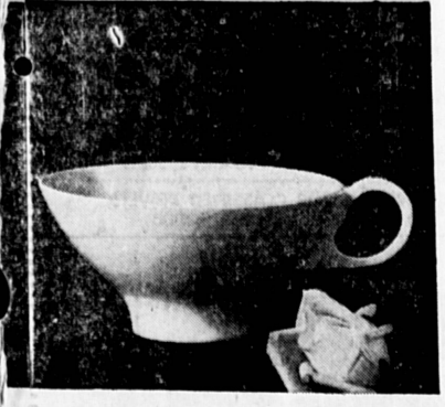
Dish-of-the-week Coffee Cup June 27 - July 3 290