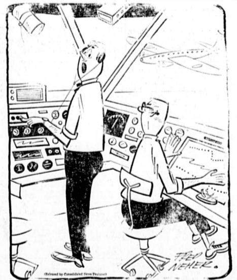
"Flight 603 wants permission to circle till the stewardesses get the dishes done."