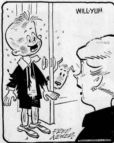
"The party was great . . . Two fist fights . . . Three hair pullings and his mother got a headache!"