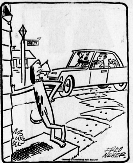
'Oh, Merrick . . . We forgot the dog food!"