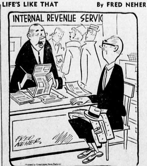
We're a little suspicious about this $6,000 deduction for entertainment . . . You don't look that gay!"