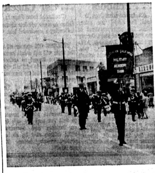
ACADEMY BAND . . . Smartly attired in dress blue uniforms the Southern California Military Academy band proudly marched in the annual Armed Forces day parade. The academy, a long established Southland educational institution, is located in Signal Hill.