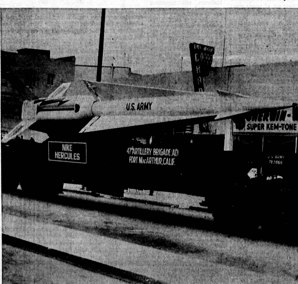
TODAY'S ACK-ACK . . . Gone are the cumbersome, shortne Nike Missile, a supersonic guided missile that seeks out and destroys enemy aircraft miles before they reach