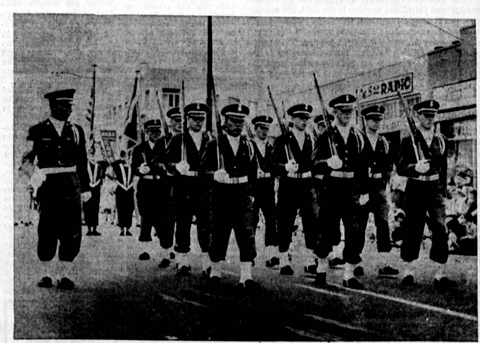
FANCY STEPPERS . . . Precision drilling delighted crowds