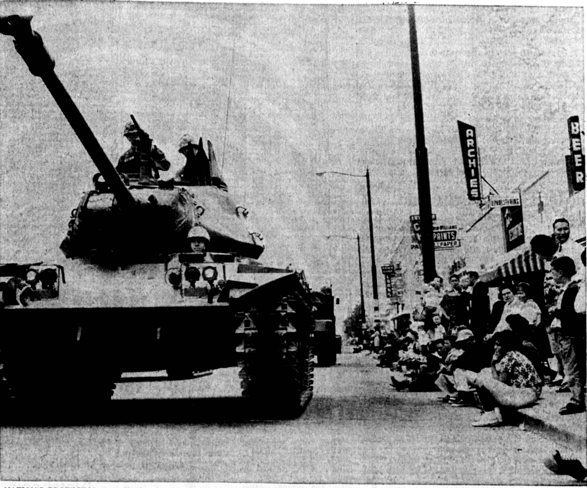
NATION'S PROTECTOR . . . Clawing its way down the two-mile Armed Forces Day parade route in Torrance yesterday, a tank from the Inglewood National Guard unit puts its wares on display for a sidewalk full of spectators. The 80-unit parade, stretching two miles in length, capped a week-