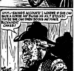
By PETE HOFFMAN