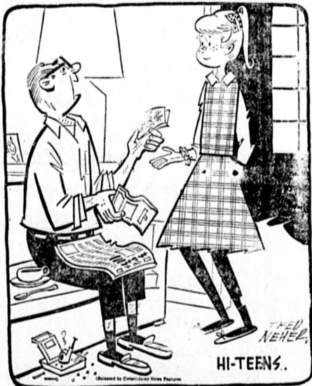
"Ballet lessons . . . ballet slippers! Couldn't you get the same exercise running your mother's vacuum?"

..more super-shoppers depend on Lucky Bonded Beef for perfect tenderness - EVERY TIME!