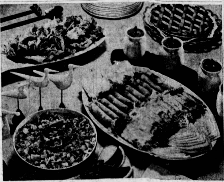
NOTHING SPELLS CASUAL entertaining like buffet subpers. Today's convenience foods make it possible to toss off a supper while balancing two other projects in other hand. Turkeys are to be obtained as pre-cooked rolls. Staffing mix needs so few additions to be ready and today's pie comes right from the market freezer.