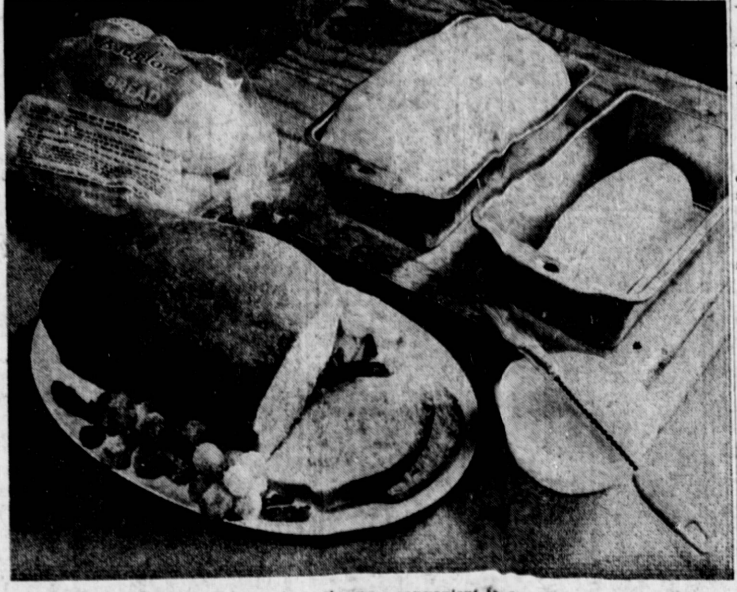
BAKING BREAD AT home from the new convenient is ozen dough is another mar-yel of our times. Freshly baked bread, warm from your one over will make you popu-lar with family and friends alike. Just plan that the loaves will disappear in a hurry!