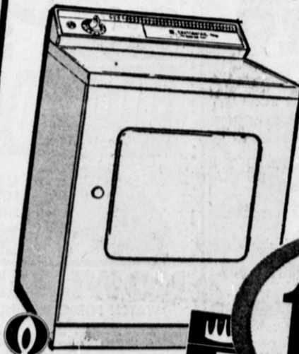
Model DDAG-63, Gas LAY-A-WAY NOW! SMALL DEPOSIT HOLDS