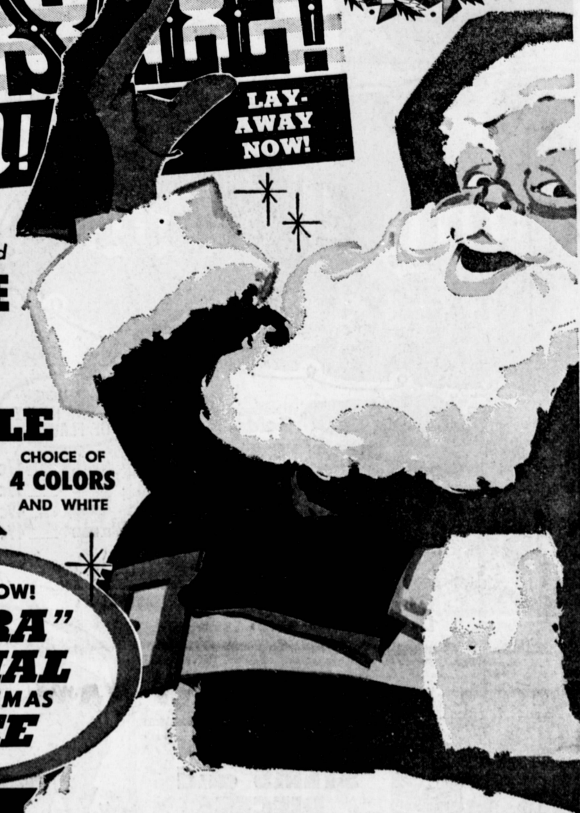
Model DW-10M 4 Colors or White