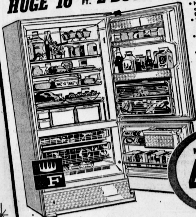
Model FPI-16B-63 15.53 cu. ft.

FRIGIDAIRE 100% FROST PROOF! HUGE 16 CU. FT. 2-DOOR Refrigerator