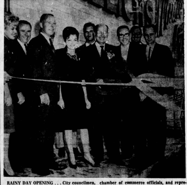
RAINY DAY OPENING... City councilmen, chamber of commerce officials, and representatives of Wallichs Music City brared the rain Friday morning for the customary ribbon cutting ceremony to commemorate the new Wallichs Music City store at Hawthorne and Artesia Boulevards.

NEWS . . . . . FA 8-4000 SOCIETY . . . FA 8-5164 CLASSIFIED . . FA 8-4000 (Ask for Ad-Taker)