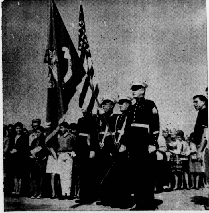
POSTING COLORS... Members of the Third Naval Gunnery Fire Liaison Co. of Long Beach, present colors during ceremonies at South High School Friday honoring veterans of the nation's wars in observance of Veterans Day on Monday. The ceremony was scheduled Friday as the city's schools will be closed Monday.