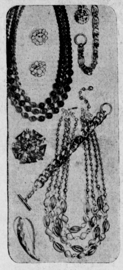
Tailored & dressy Costume Jewelry

Plenty of necklaces, pins, bracelets and earrings. You can sparkle, glitter or glow subtly to suit the occasion with our wonderful assortment especially priced for this sale. Fine jewelry to accent day through evening and save at the same time! may co. costume jewelry 22~