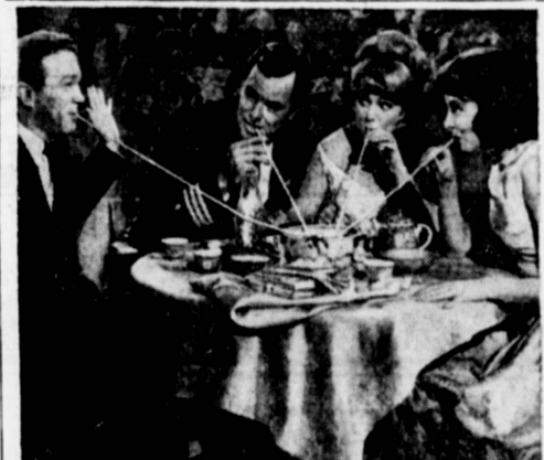
OPENING PARTY . . . Red Buttons, Gig Young, Shirley Jones and Carolyn Jones will star in "A Ticklish Affair" which will be presented at the opening of the Rolling Hills Theatre on Tuesday, Oct. 1. Proceeds from the opening will go to the Torrance YMCA. The Metro-Goldwyn-Mayer comedy centers around a young widow who would rather be merry than married—she thinks.

Read your next lease with care. And don't sign any "waivers" of your rights without knowing what they are. Landlords, too, should know that they can protect themselves from vandalism or failure by the tenant to move out in time. Check your leases with a lawyer. Perhaps you can, for example, have tenants put up money or a bond to make sure they take care of your place and meet other terms of the lease.