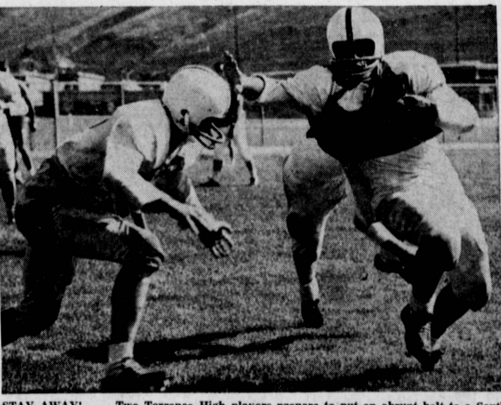
STAY AWAY!.. Two Torrance High players prepare to put an abrupt halt to a South High halfback during a controlled scrimmage Monday. Both schools will open their preleague pigskin seasons this weekend with Torrance entertaining Redondo tomorrow night and South hosting El Segundo Saturday evening on the THS turb. The Tartars are defending Pioneer League champions while the Spartans will be attempting to better a 0-8 record last year.