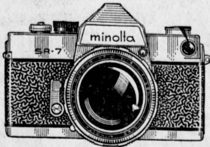
World famous MINOLTA SR-7 35 m.m. Single Lens Reflex. Renowned for its true versatility of a 35 mm. camera system. See the many precise interchangeable accessories that are adaptable to this camera.

Torrance Camera "Everything Photographic"