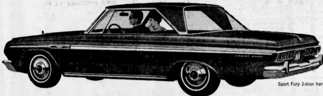
Sport Fury 2-door hardtop

This good-looking 1964 Plymouth really gets up and goes and has a 5-year/50,000-mile warranty* to keep it going that way.