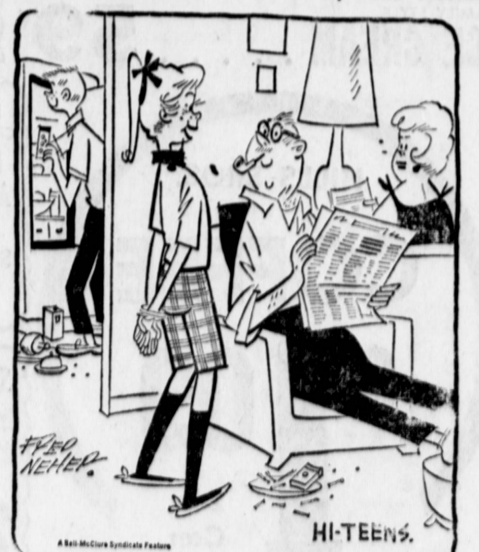
"You're wrong about Jimmy being hard to get along with . . . He's satisfied with almost anything in the refrigerator."

GARDEN FRESH YOUNG CARROTS 2 lb. cello bag 15c