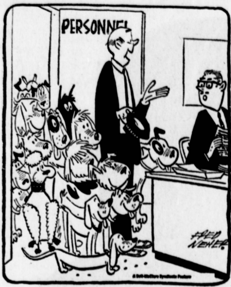
"Your ad stated you wanted a man who was popular and had many friends."