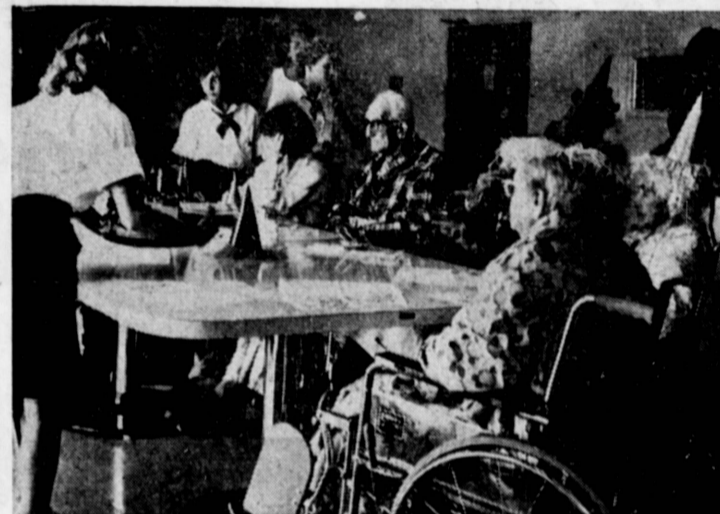
NEVER TOO OLD . . . Patients at the Fairmont Convalescent Home, 22617 Vermont, go on the theory you are never too old to enjoy a birthday party. Members of the Okita Junior High Camp Fire Girls of the Harbor District hold a birthday party once each month of patients having birthdays during that month. The girls furnish table decorations, favors and tokens of remembrance such as combs and pens.