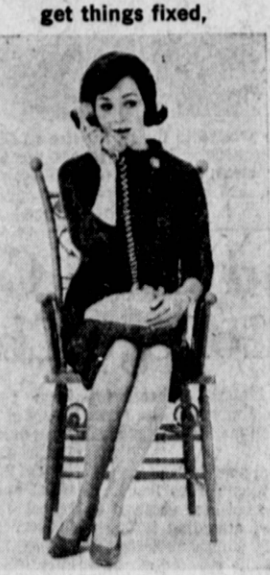
Right! Your telephone.