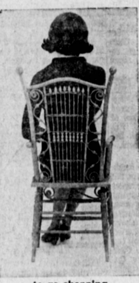
to go shopping,