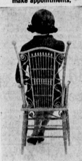
round up the kids?