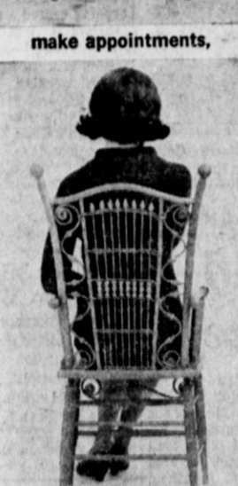
invite friends over,