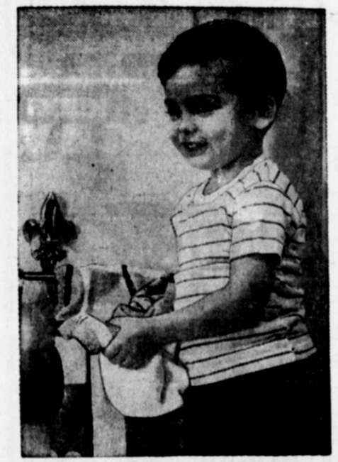
RiGHT START . . . Lessons in cleanliness should begin early—and this little fellow is not a bit too young to be taught to use soap and water often. He'll be less susceptible to infection if he learns this lesson well.