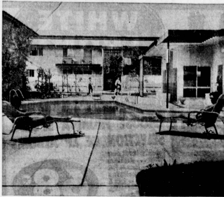
PATIO ATMOSPHERE . . . Owners of Del Amo Pacific in the east section have moved into their new apartments. Typical of the atmosphere in the recently completed section is this patio and pool area in the center. Developed by Sovereign Development Co., the apartments are located at 3300 W. Carson St.