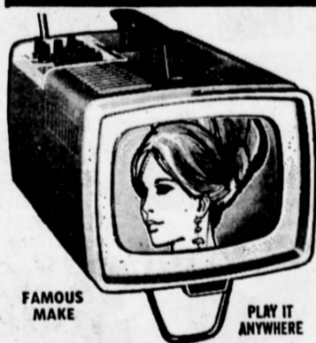
FAMOUS MAKE PLAY IT ANYWHERE