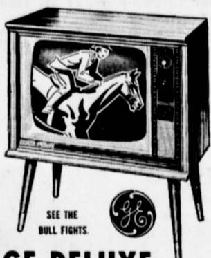
SEE THE BULL FIGHTS