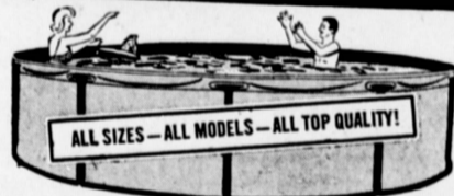
ALL SIZES — ALL MODELS — ALL TOP QUALITY!