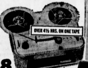
OVER 4 1/2 HRS. ON ONE TAPE

With automatic tape lifters, balanced fly-wheel plus sensitive mike. 78 88 TERRIFIC VALUE