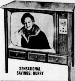
SENSATIONAL SAVINGS! HURRY