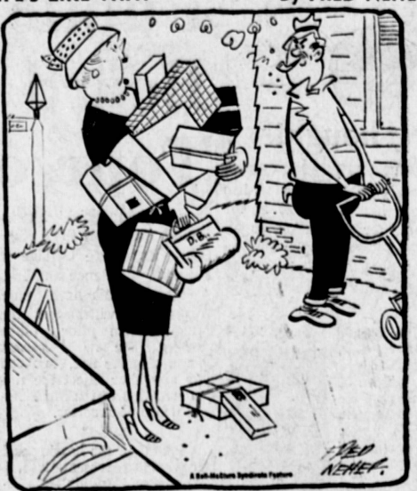
"Don't just stand there and scow! . . . EXPLODE:!!"