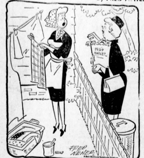
gave up trying to live within our income . . it's all we can do to live within our credit."