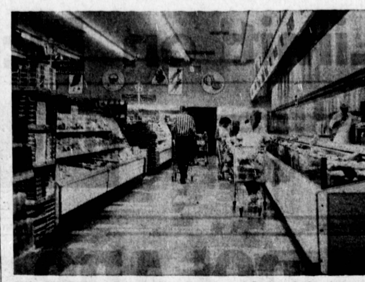
STORE REOPENED . . . Lucky Market at Crenshaw and Torrance boulevards was reopened Thursday following a $100,000 remodeling which saw the market closed for three days last week. The newly decorated market features larger stocks, new shelving, refrigerated cases, floor, lights, check stand, and automatic doors leading to the large parking lot.