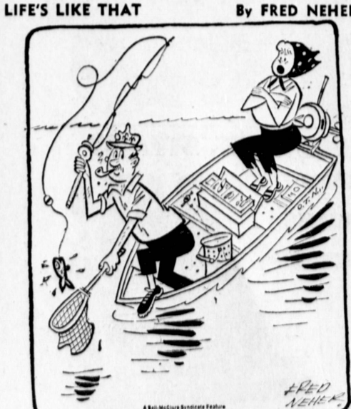
"I'd say you're contributing to juvenile delinquency!!"

Profits . . . are the keystone of the American economy. although since the early days of the New Deal there has been a persistent effort to denigrate them. Without profits, no capital investment. Without capital investment, no jobs, no dividends or interest. In the long run, no tax revenue.