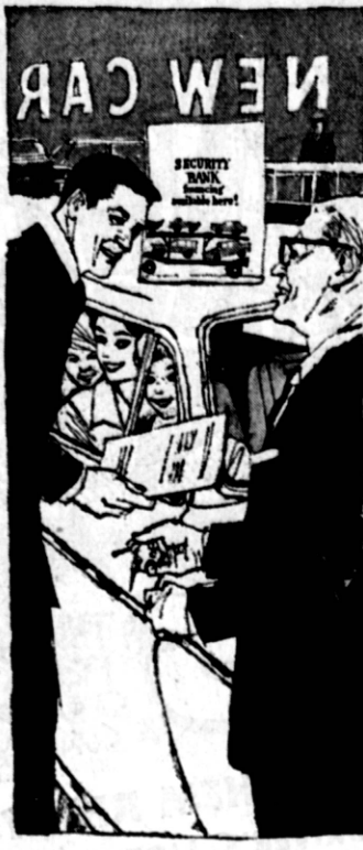
When you've made a choice, ask him for this important extra: Security Bank financing.