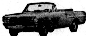
1963 TEMPEST LE MANS CONVERTIBLE